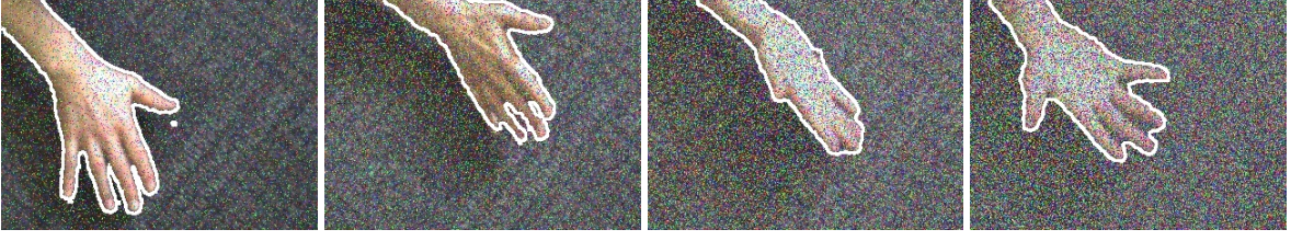
Figure 1. Example use of proposed model similarity and dissimilarity matching method in object tracking for varying amounts of noise (tracking framework from the authors' work in [3]).

thetically exist, i.e. \mathcal{M} = \{\forall \mathbf{x} : m(\mathbf{x}) = 1\} , that is obtained if P(f|I_f) has been optimized for the data at hand. This is of course also dependent on the availability and selection of appropriate features, the probabilistic modeling and optimization. However, we do not seek to utilize \mathcal{M} directly. Instead, we assume the availability of the model likelihood, p(I|m) which is possible from the result of prior processing (e.g. object tracking) or supervised training. Fig. 1 gives an example where the bootstrapping stage of the object tracking application provides a good estimation of the foreground object, whose photometric model can be fed to the method proposed in this paper to estimate the location of the object in the following frames to, in turn, further assist object tracking.