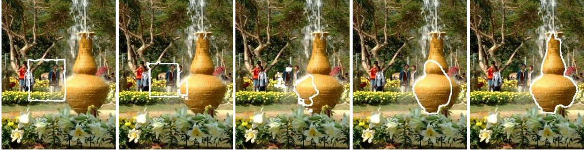
Figure 2. Convergent results obtained for poor initial conditions using proposed model.

for the currently defined foreground pixels \mathbf{f} , and (b) the background PDF p(I_{\mathbf{x}}|\mathbf{b}) and the model PDF for the currently defined background pixels \mathbf{b} , and the third imposes smoothness throughout the image space by minimizing the foreground labeling gradient magnitude.