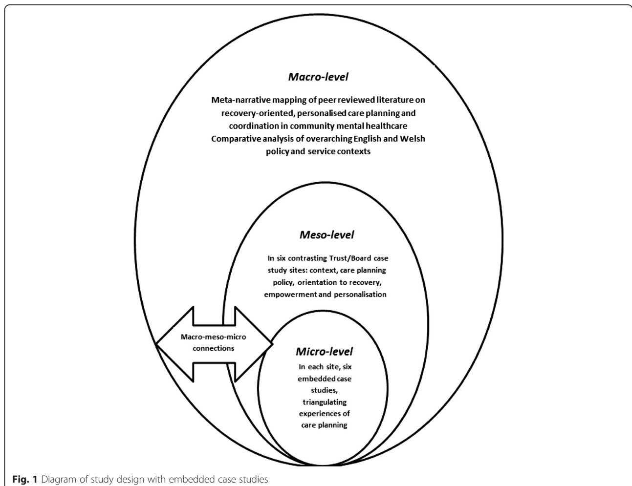
Fig. 1 Diagram of study design with embedded case studies

Access was secured to six National Health Service (NHS) organisations providing mental health care: four Trusts in England (pseudonymously referred to as ‘Artois’, ‘Dauphine’, ‘Languedoc’ and ‘Provence’) and two Local Health Boards (LHBs) in Wales (‘Burgundy’ and ‘Champagne’). Sites were selected to reflect geographical, population and urban/rural diversity (see Table 1). With help from local collaborators and research support staff, access was secured to 20 community mental health teams (CMHTs) across the six sites, with one specific team within each of these sites identified for in-depth case studies. In the UK CMHTs are the main vehicles for the local provision of secondary mental health care, and are typically funded by NHS and local authority organisations and staffed by health and social care workers, including psychiatrists, mental health nurses, occupational therapists, psychologists and social workers. Sampling criteria for CMHTs included the routine provision of care to adults, having a team manager in post and not being scheduled for merger or closure.