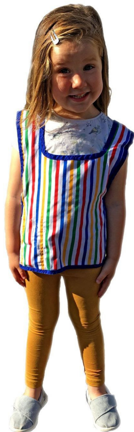
Figure 1 Custom-made tabard with inside pockets securing the two Fitbit Zips in position (contact first author for more details on tabard construction). Consent was obtained for the publication of the child's photograph.

children typically landed on one foot first and then the other to regain their balance. If a child slid their feet along the ground or the movement was so small that the coders could not identify a step-like movement, a 'no-step' was recorded.