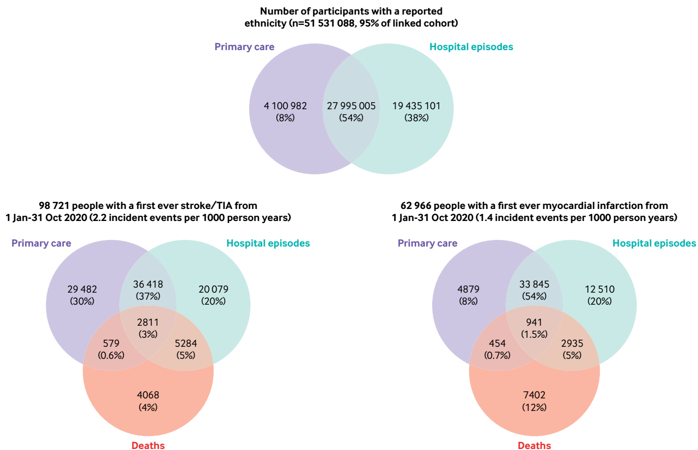
Fig 2 | Data sources reporting person level data on ethnicity, incident stroke or transient ischaemic attack (TIA), and incident myocardial infarction

with covid-19 on the death certificate, 35 the data from our linked cohort concurs with those from relevant cumulative counts of people with covid-19 (supplementary table 8).