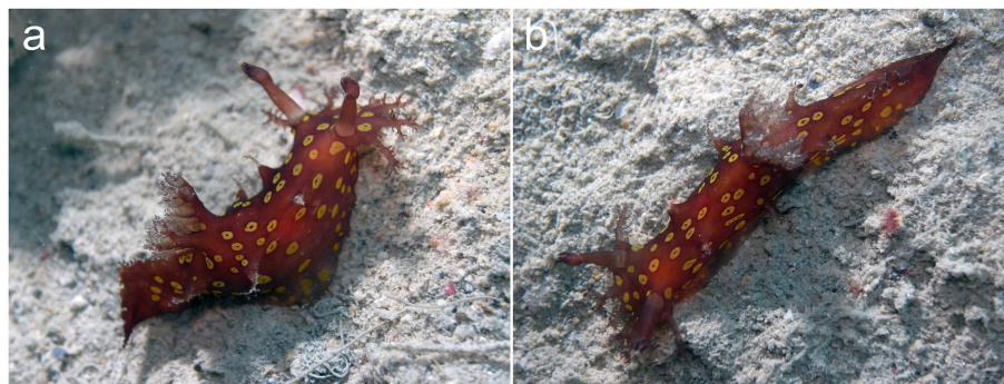
FIG. 1. A pair of the “rare” nudibranch Plocamopherus ocellatus observed in the Red Sea (Saudi Arabia), Farasan Banks, east side of Safiq Island. (a) One individual (~20 mm long) is contracted; (b) the other one (~30 mm long) is extended. Both were crawling together on sand at 27 m depth (5 May 2017) and observed by B. W. Hoeksema during scuba diving.

The nudibranch Plocamopherus ocellatus Rüppell & Leuckart, 1828 received increased scientific interest as a Lessepsian migrant when diver observations since the 1980s became the basis for publications (Appendix S1: Table S1). The recent discovery of two small specimens in the Red Sea (Fig. 1) drew attention to the question of whether it was more frequently encountered in the