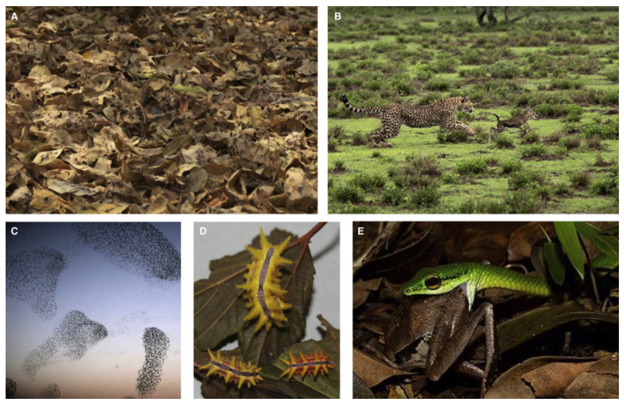
Figure 1. Prey in many guises, with different costs.

Search time is intuitive — the time a predator takes to locate a prey item in their environment. Handling time then covers the time it takes the predator from locating the prey item to fully consuming it. This includes catching the prey, preparing it to be eaten and then actually ingesting it. The amount of searching and handling required can vary widely depending on how conspicuous the prey are (Figure 1A), whether they are mobile (Figure 1B), if they have evolved any anti-predator defences (Figure 1C,D) and their size and shape (Figure 1E).