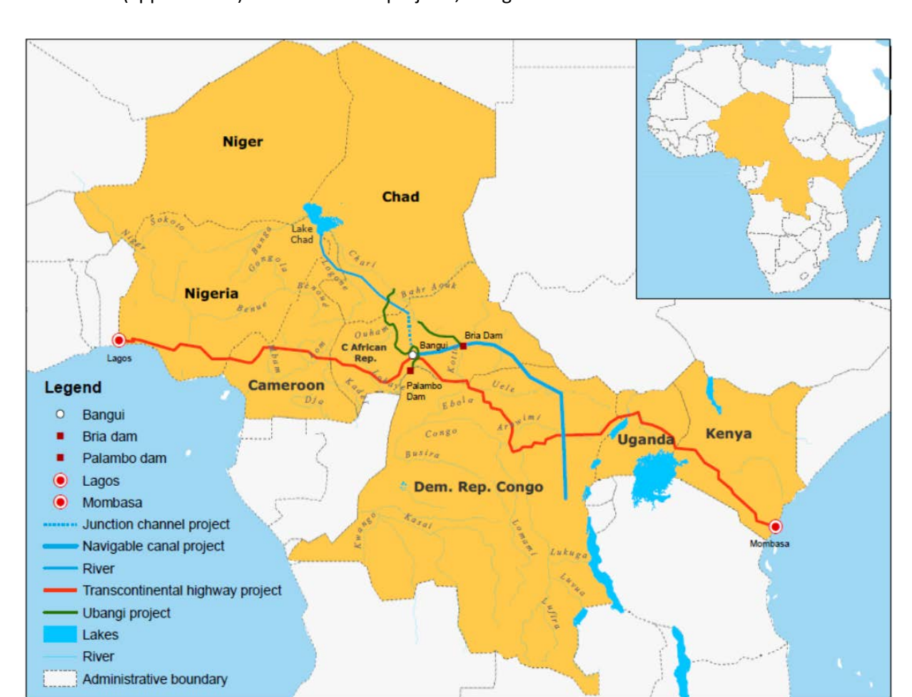
Figure 2. Map showing two IBWT project proposals to connect Lake Chad and the Congo River, presenting an (approximate) overview of the projects, along with the available information.