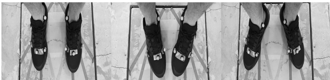
Figure 1: Feet placement over the force plate during the three static positions (Left picture = 0 degrees, Middle picture = Toe-in 20 degrees, Right picture = Toe-out 20 degrees)

This study involved a within-subject repeated design where each participant was tested in three conditions. The three static positions used to analyse the same dynamic trials were with the foot positioned as follows: 1) 20-degree toe-in, 2) 0 degree, 3) 20-degree toe-out. (See Figure 1). Participants were instructed to bring their own everyday shoes.