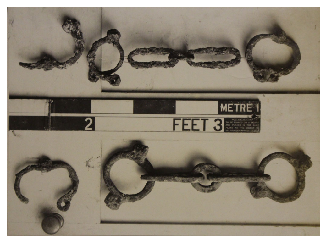
Fig 3. A further two sets of shackles recovered from excavations at Old Sarum, seen in a photograph from D H Montgomerie's Album Accessioned 1936.

incarcerated with the bishop were a number of shackled individuals, some of whose bodies were cast out around the time the bishop himself was exhumed and the cathedral demolition commenced in 1226. How directly the archaeological information presented here might be related to the circumstances of Roger's final days will be returned to below. First, however, the historical setting and what can be gleaned from the various accounts of 1139 will be explored for the information they can contribute to our understanding of the archaeological deposits recovered in May of 1913.