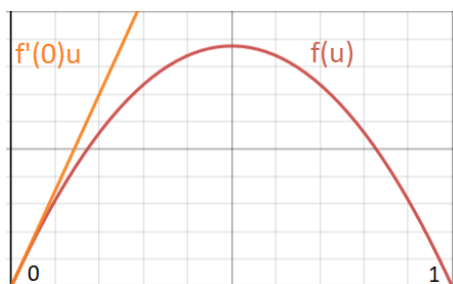
Figure 1: Illustration d'une fonction de réaction typique satisfaisant la condition KPP.

Comme nous l'avons mentionné précédemment, beaucoup de travaux ont été effectués concernant ce type d'équations dans des cylindres non bornés, sans terme de convection, voir [BN2], [BLL], [ROQ] et [VE1]. Certains articles considèrent un terme de convection en dimension 1, voir [CRO], [CRM] et [CRT]. Des résultats d'existence ont été prouvés dans ce cas, voir [CRM, Théorème 2.4], [CRO, Théorème 2.4] et [AKC, Théorème 3.6]. Dans cette thèse, nous étendons ces résultats. Dans le cas multidimensionnel, un grand drift à divergence nulle a été considéré dans [BHN], avec les conditions au bord de Dirichlet ou de Neumann, ou le cas périodique, où les auteurs ont étudié le comportement asymptotique de la valeur propre principale d'un opérateur elliptique.