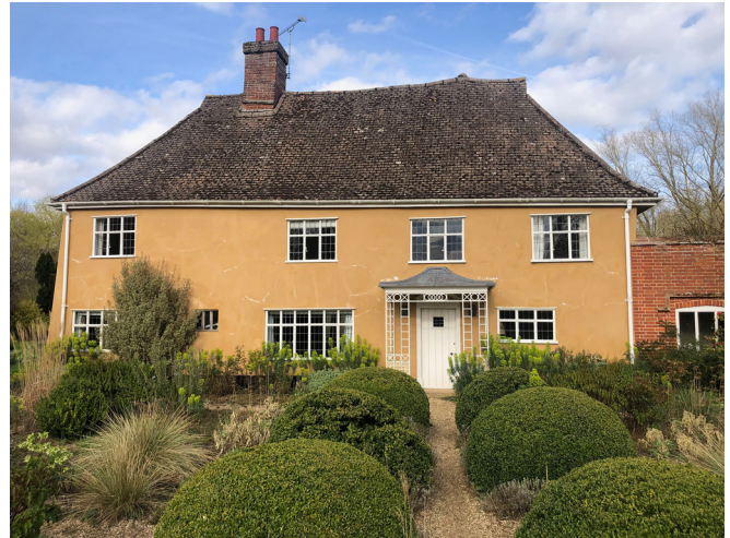
Barley House Farm, Winston, Suffolk (1534i); see p. ***.