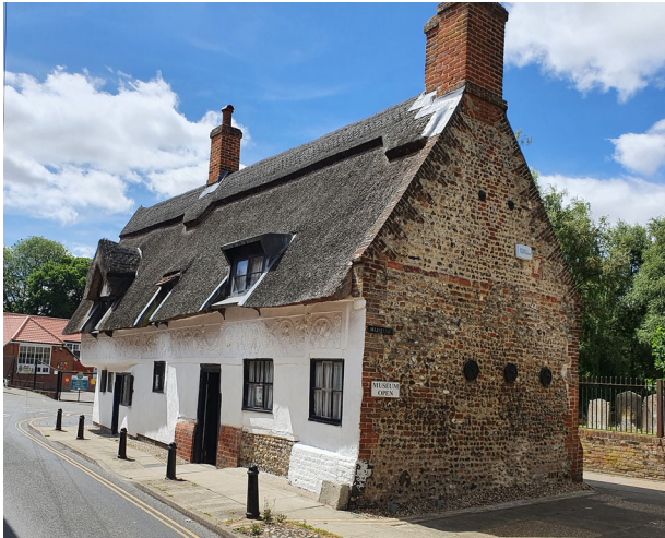
Bishop Bonner's Cottage, Dereham, Norfolk (1575–1600i; 1680–1705i); see p. ***.

For an image of this building, see this page (Fig. 2)